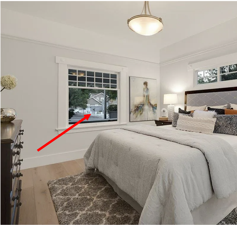
Photo 3: Existing window (street facing) to be removed, replaced with door to new bathroom.