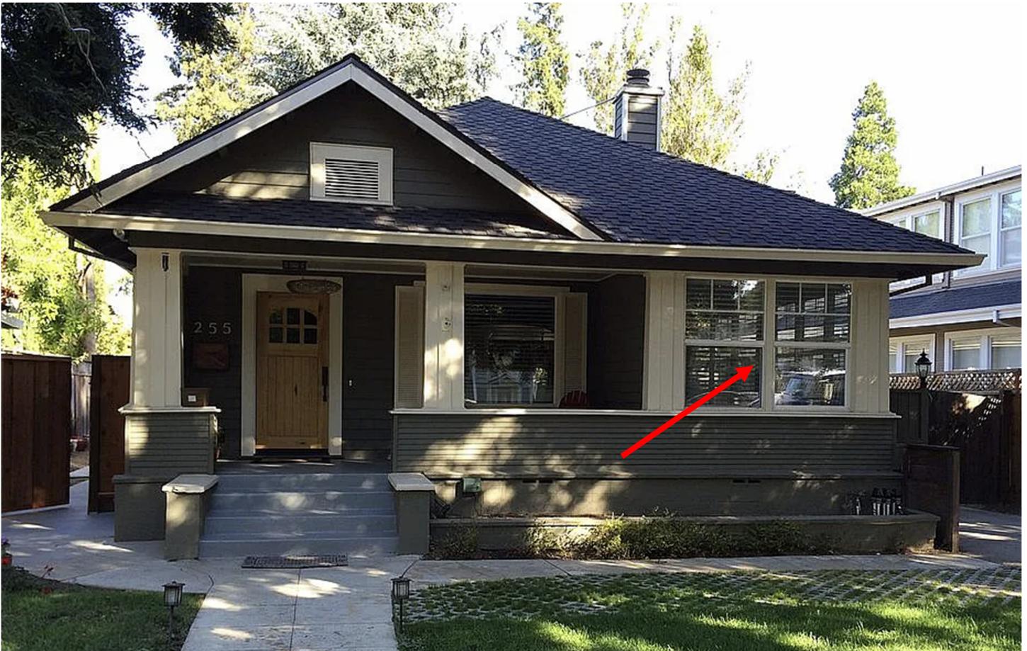
Photo 4: Reference image of 255 Los Gatos Blvd. showing partially enclosed patio (right side). With two new windows. Proposed modification to subject property (333 Los gatos Blvd) would be a single window with additional wood siding to match existing.