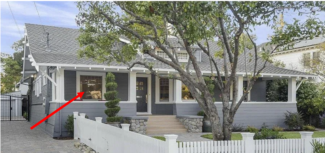
Photo 1: Existing property, front patio. Added bathroom would enclose section to left of entry door, between the first two white columns.

Add approximately 65 sf of enclosed space on the existing patio to the left of the entry door when facing the property from the street. Existing roofline to remain as is, no modifications to be made. Bathroom will be approximately 10'-0" x 6'-10", therefore falling below the 25% threshold per Section 29.10.020 of the Los Gatos Town Code when it comes to removal of existing walls facing a public street. To enclose this section of the existing patio, we will use wood siding to match existing, along with installing two new windows, one facing the street and the second facing the driveway. Covered patio to the right of entry door to remain as is, no modifications. Once scope of work is complete, our intent is that it looks and feels as though it was part of the original structure when the home was build in 1912.