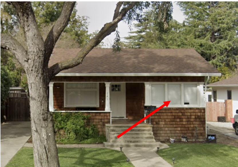
Photo 5: Reference image of 241 Los Gatos Blvd. showing partially enclosed patio (right side). With three new windows. Proposed modification to subject property (333 Los gatos Blvd) would be a single window with additional wood siding to match existing.