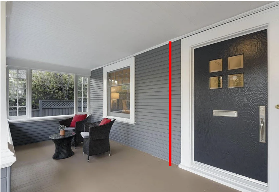
Photo 2: Proposed bathroom would enclose this section of the patio, starting approximately 6"-12" from existing entry door trim (see red line above). No modifications to be made to entry door/trim.