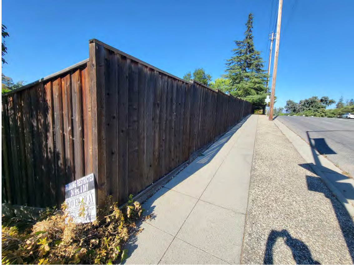
Pollard Ct and Pollard Rd intersection Cont: