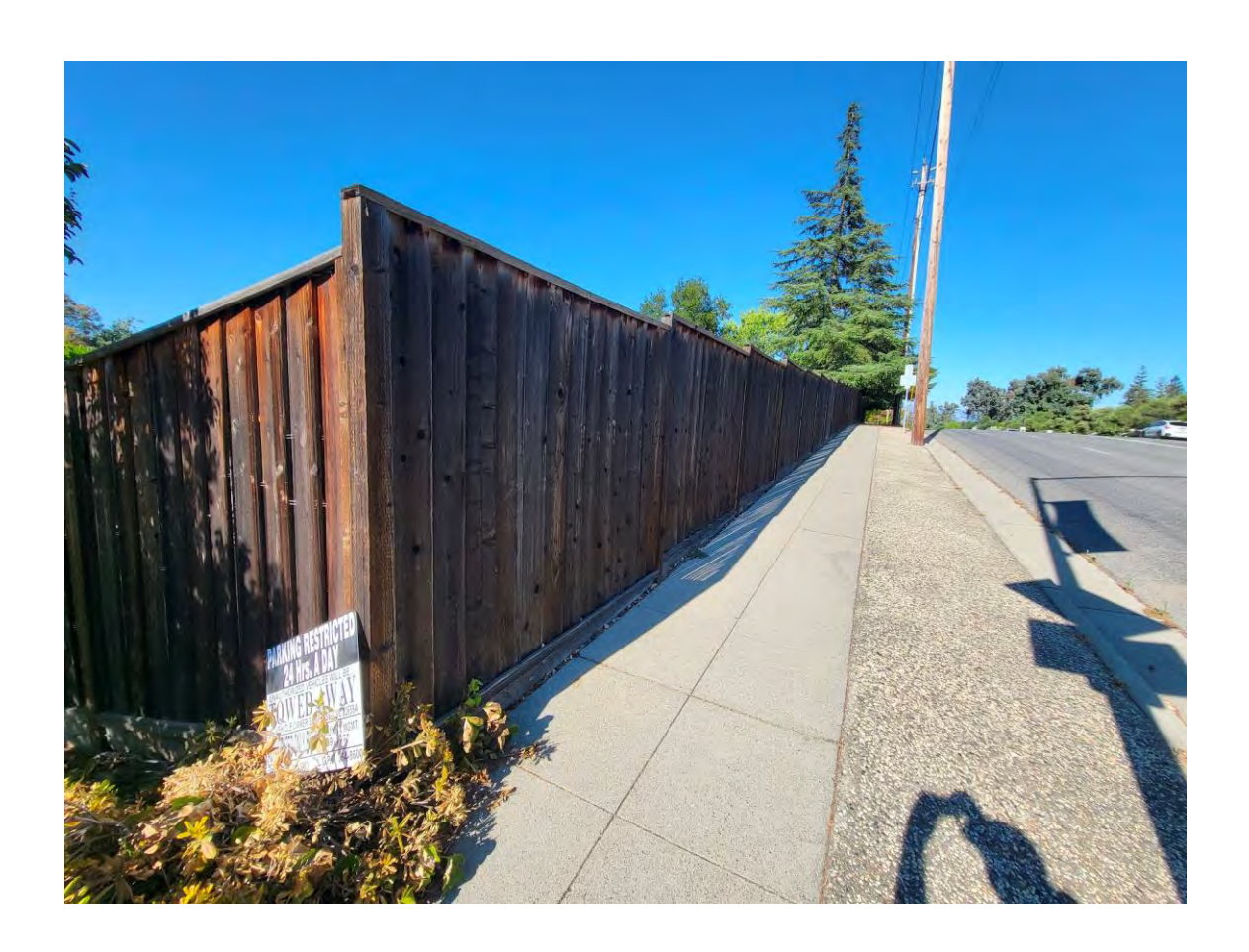
Pollard Ct and Pollard Rd intersection Cont: