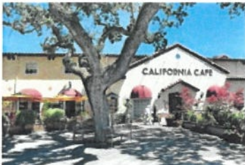
cal cafe sign.jpg 44K