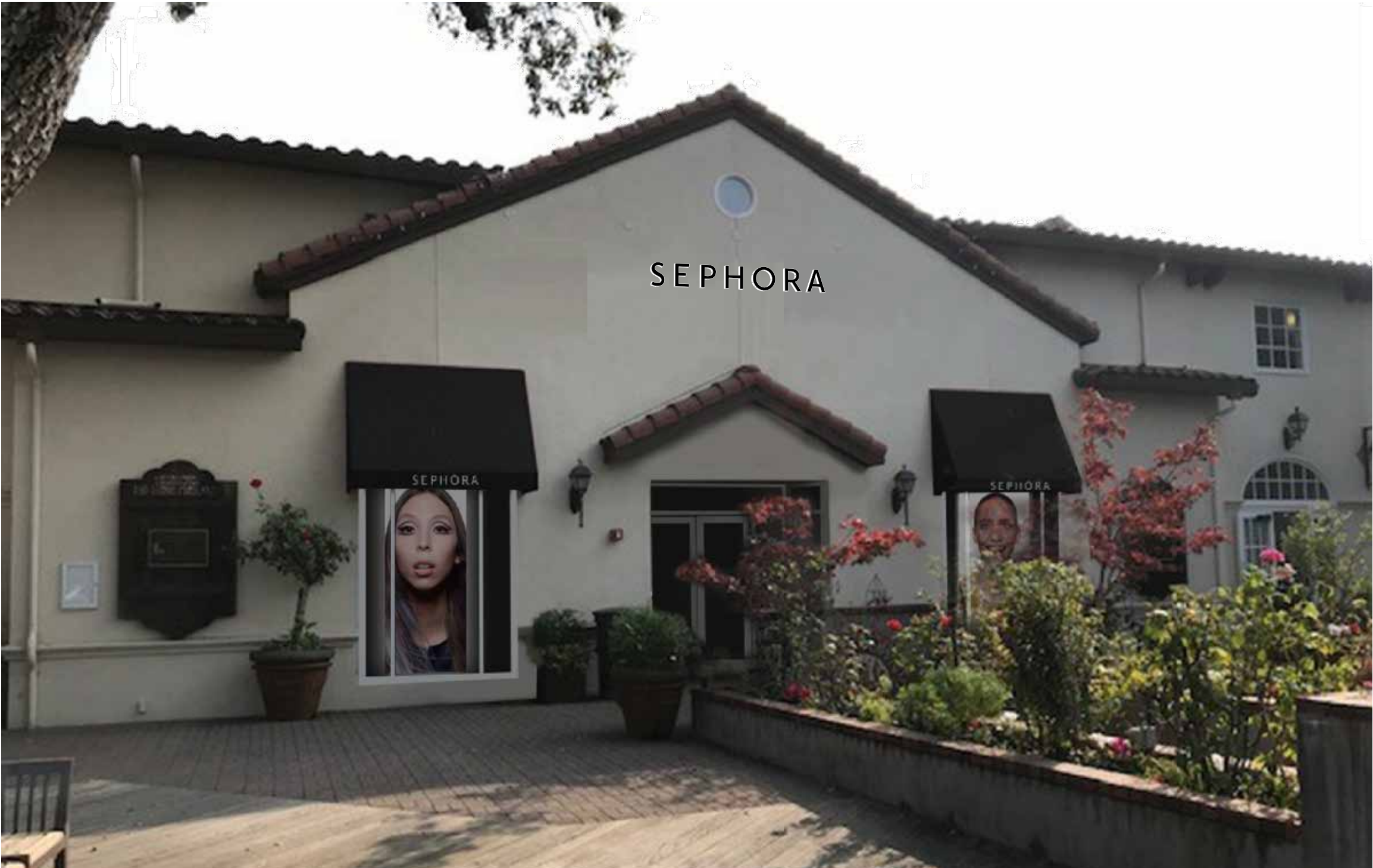
CONCEPTUAL RENDERING SCALE: NTS