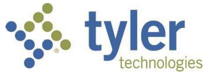
Exhibit 1 Amendment Investment Summary

The following Investment Summary consists of two (2) sales quotations, which detail the software, products, and services to be delivered by us to you under the Agreement. This Investment Summary is effective as of the Amendment Effective Date.