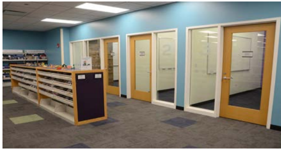
Library group study rooms

In contrast, the Los Altos Library provides one large room for teen study. Tutors often tutor students in the open leading to a lack of privacy and noise.