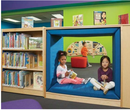
Creative Reading Spaces