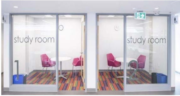
Library tutor rooms