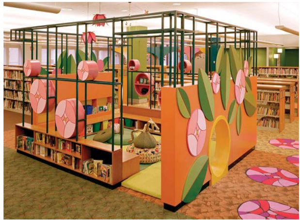
Dynamic Early Learning Spaces