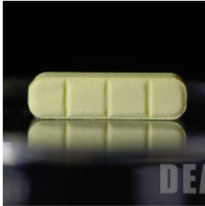
Counterfeit Xanax ® Back