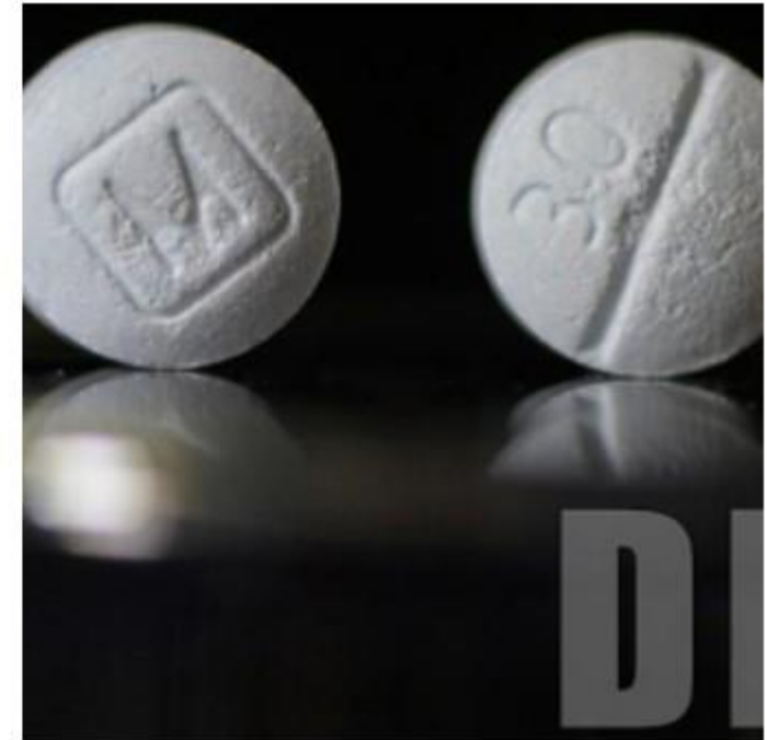
Authentic Oxycodone Side by Side