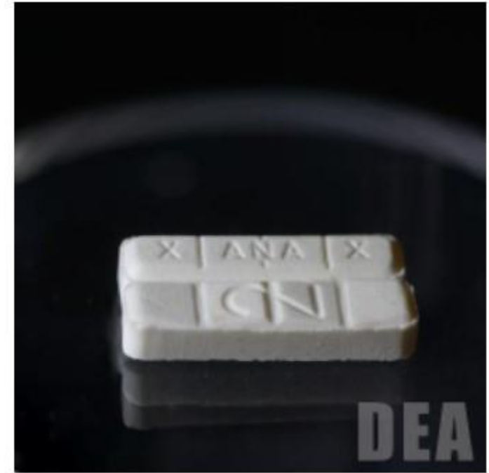
Authentic Xanax® Side by Side