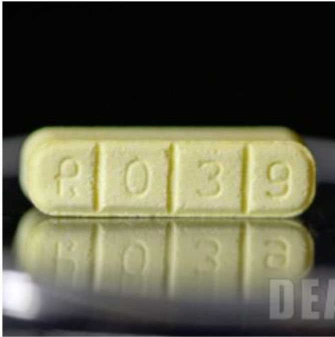
Counterfeit Xanax ® Front

Street Names: Bars; Benzos; Bicycle Handle Bars; Bicycle Parts; Bricks; Footballs; Handlebars; Hulk; Ladders; Planks; School Bus; Sticks; Xanies; Yellow Boys; Zanbars; Zannies; Z-Bars