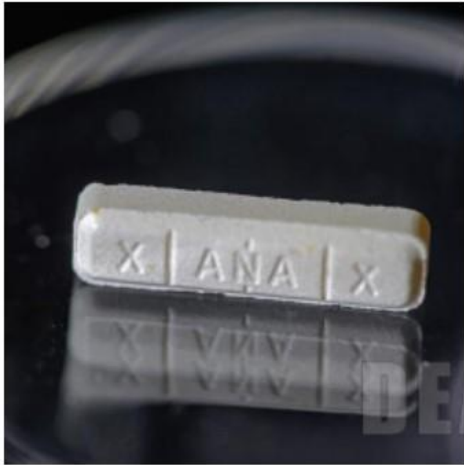
Authentic Xanax® Back

Depressants that produce sedation, induce sleep, relieve anxiety and prevent seizures. Available in prescription pills, syrup and injectable preparation. Prescribed as Valium®, Xanax®, Restoril®, Ativan®, Klonopin®