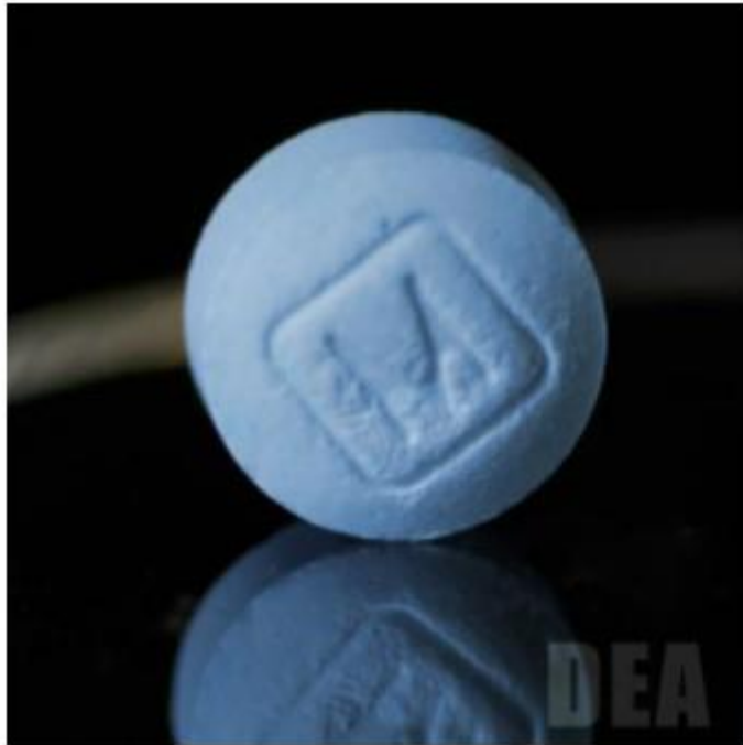
Authentic Oxycodone Front

Synthetic opioid drug prescribed for pain as OxyContin®, Tylox®, and Percodan®. These drugs are derived from one species of the poppy plant and have a high potential for abuse.