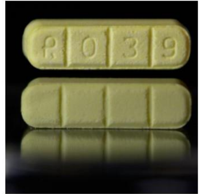
Counterfeit Xanax ® Side by Side