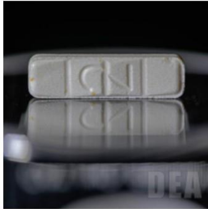
Authentic Xanax® Front