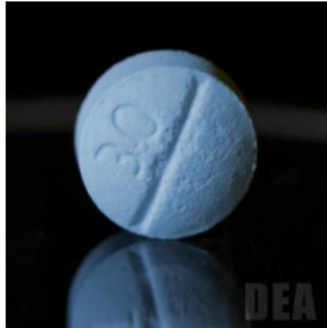
Authentic Oxycodone Back