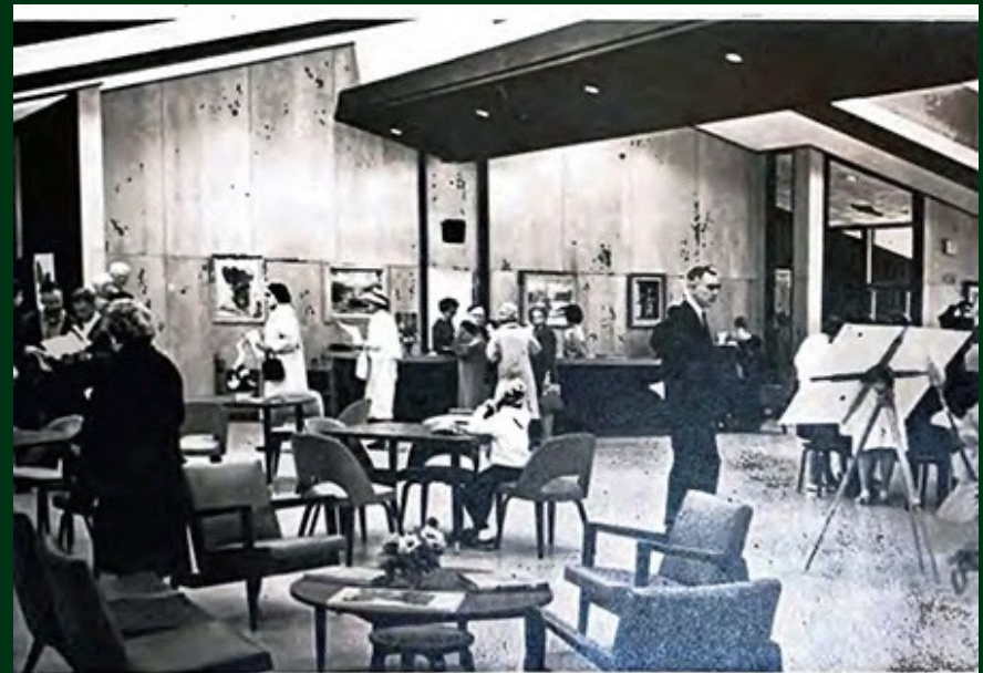
Fig. 9—Interior view of new building, 1964.