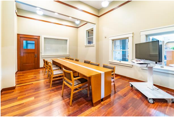
Milpitas (60k ft 2 )