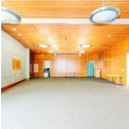
Morgan Hill (30.5k ft 2 )