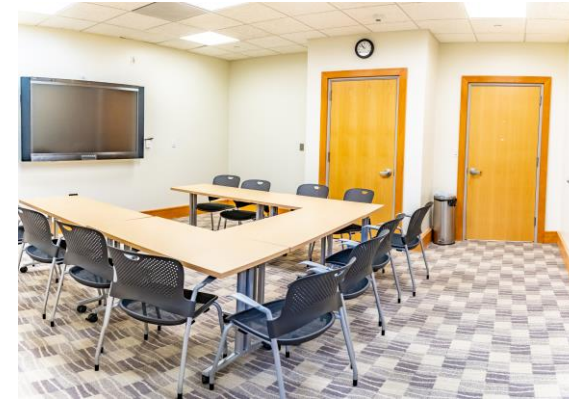
Saratoga (48.5k ft 2 )