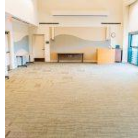
Gilroy (53k ft 2 )