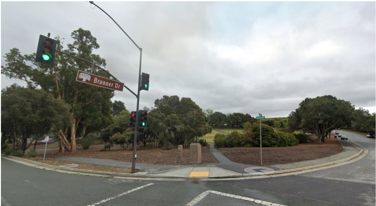
Parking area at Foothill Tennis & Swim Club, Palo Alto