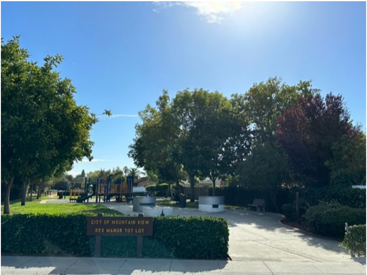
Alta Mesa Memorial Park @ 700 Arastradero Rd, Palo Alto