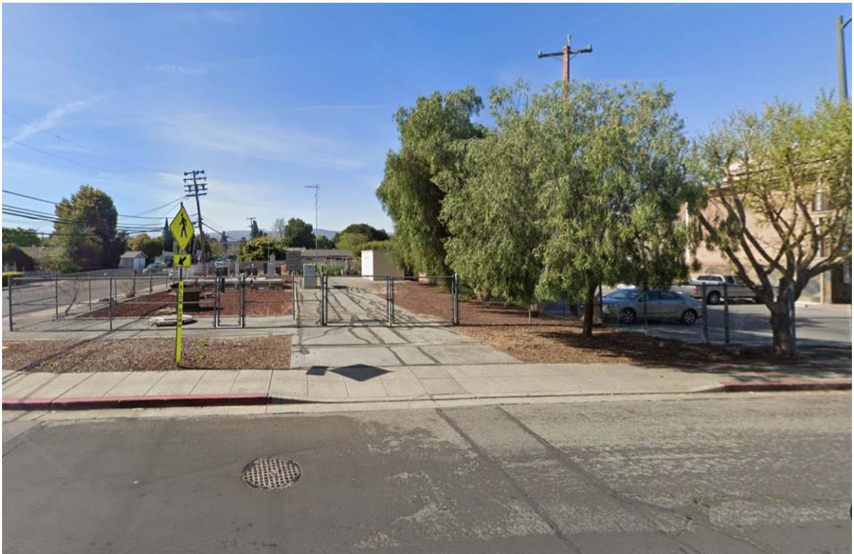
Albert Augustine Memorial Park @ 394 Coelho St Milpitas