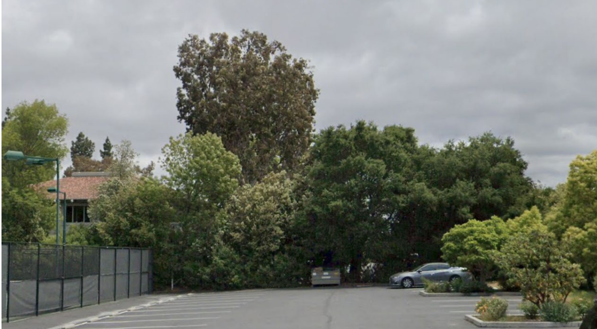
166 Escuela Ave. Mountain View