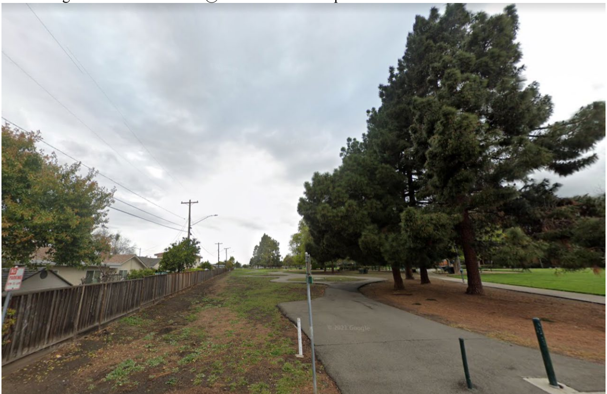
700 Tangelo Ct. Fremont