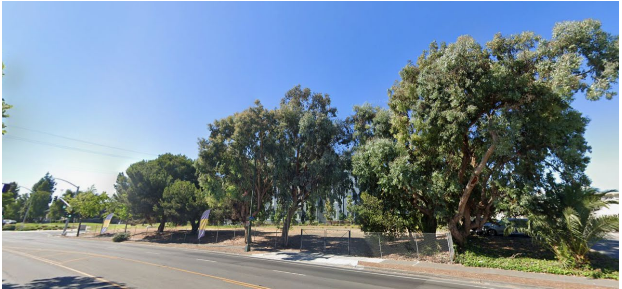
Stanford Hills Park, Stanford