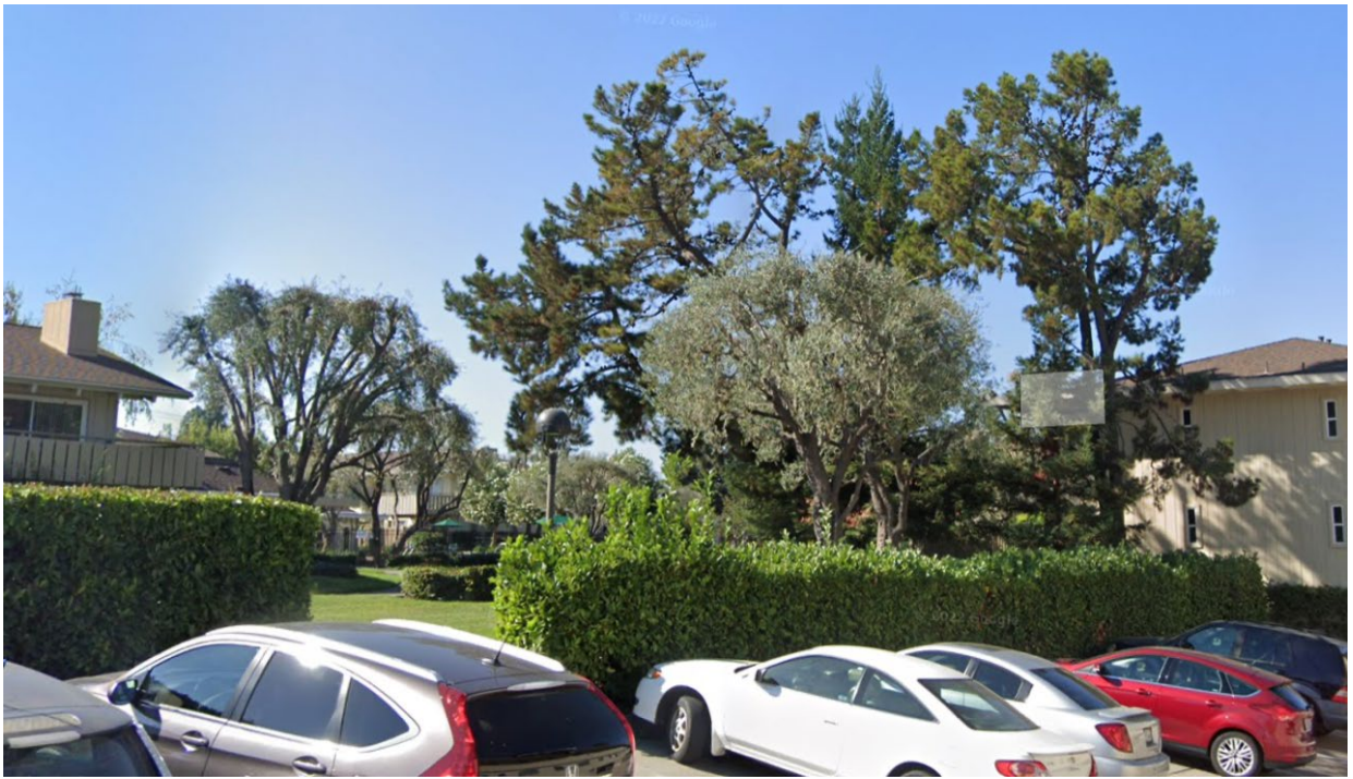
2333 California St across from Klein Park, Mountain View