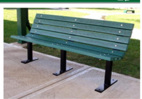
Model PB6-CON | Green

Personalize any Contour Bench with a school