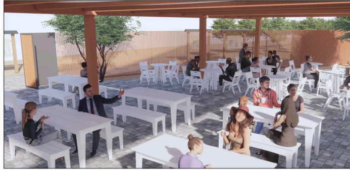
VIEW UNDER COVERED PERGOLA FROM WEST