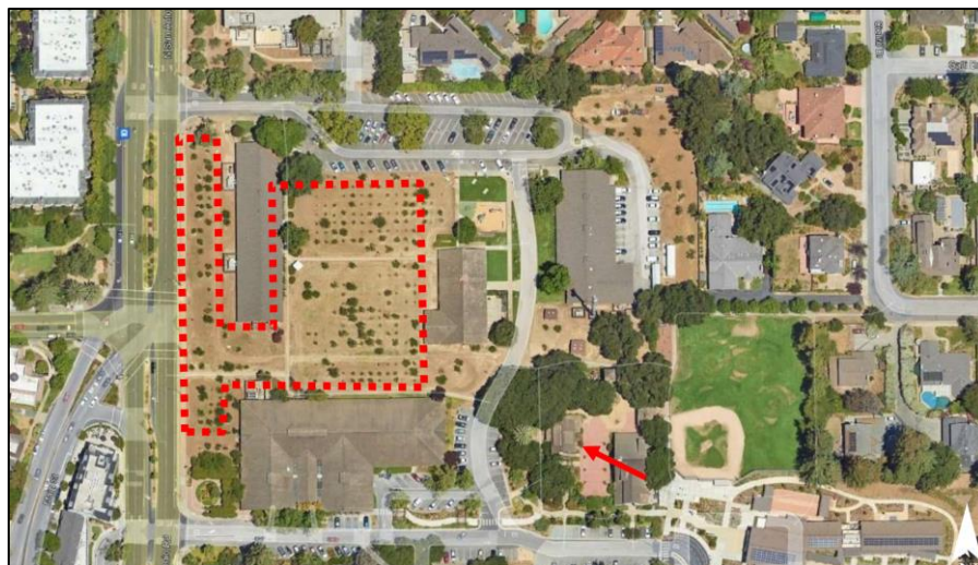
Figure 3: Aerial Photograph of Civic Center Orchard Boundaries

connects north of the Los Altos Library and south of City Hall. The boundaries of the orchard have remained the same since 1991, and many trees within the orchard have been replaced over time since some have died or were removed due to disease. The number of trees planted within the boundaries of the resource have varied over time and there is not a defined number of trees or planting sites established with the original designation in 1981 or in 1991 when the boundaries were clearly defined. The orchard is organized into rectangular sections with orthogonal rows of trees. In early 2024, the orchard was planted with many new apricot saplings and drip irrigation was added.