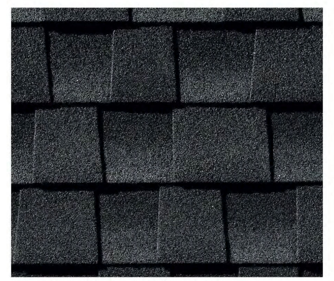
COMPOSITION SHINGLE ROOF GAF - CHARCOAL