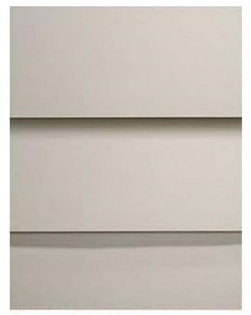
CEMENTITIOUS HORIZONTAL & VERTICAL SIDING SW 9165 GOSSAMER VEIL

WOOD FASCIA, EAVES, TAILS, HEADERS, BEAMS, DECORATIVE WOOD COLUMNS & CEMENTITIOUS TRIM SW 7005 PURE WHITE