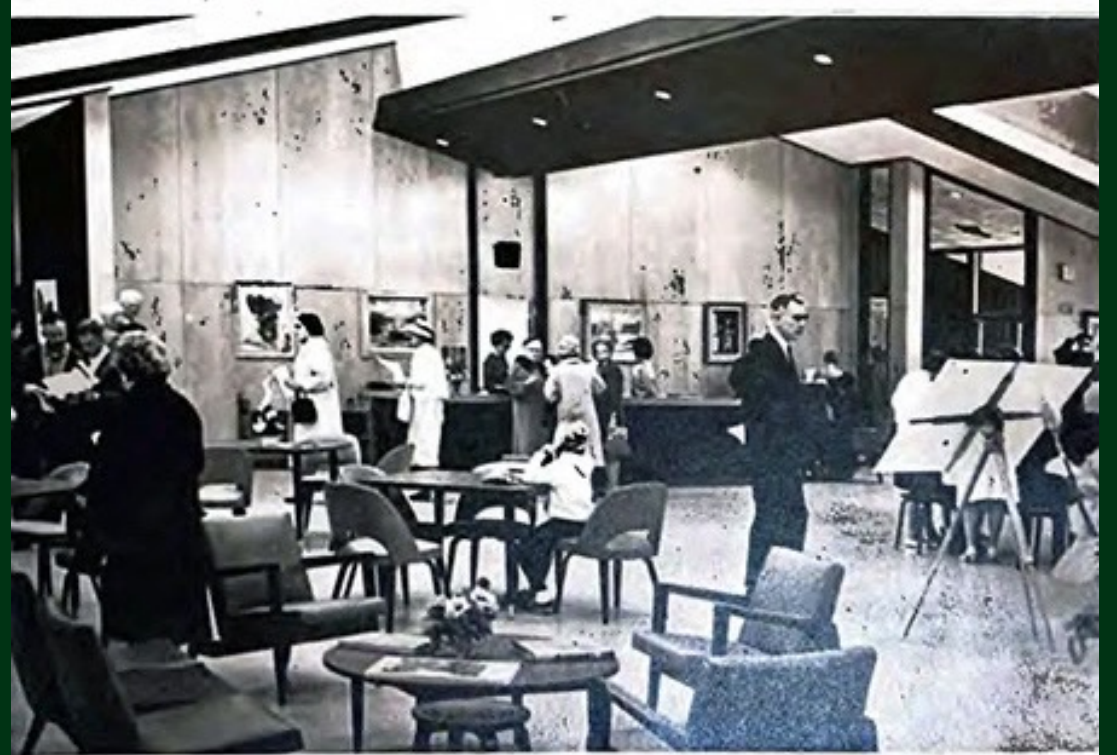
Fig. 9—Interior view of new building, 1964.