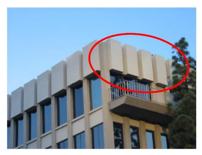
Figure 1: This well-concealed wireless telecommunications facility has its antennas architecturally integrated into the building.

integrated (concealed) facility would be infeasible or would reduce the number and overall visual intrusiveness of wireless telecommunications facilities required to provide service within the City.