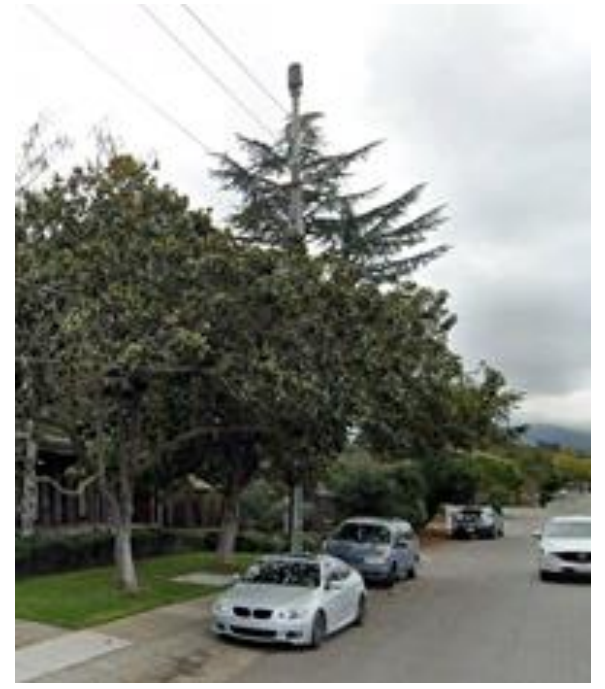
Figure 7: Landscaping conceals wireless telecommunications equipment mounted on the exterior of this pole located on Distel Drive.