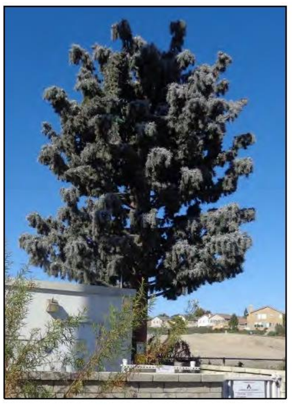
Figure 6: In this example, antennas are concealed by the faux "mono-pine."

that integrates the faux tree with added species of a similar height and type.