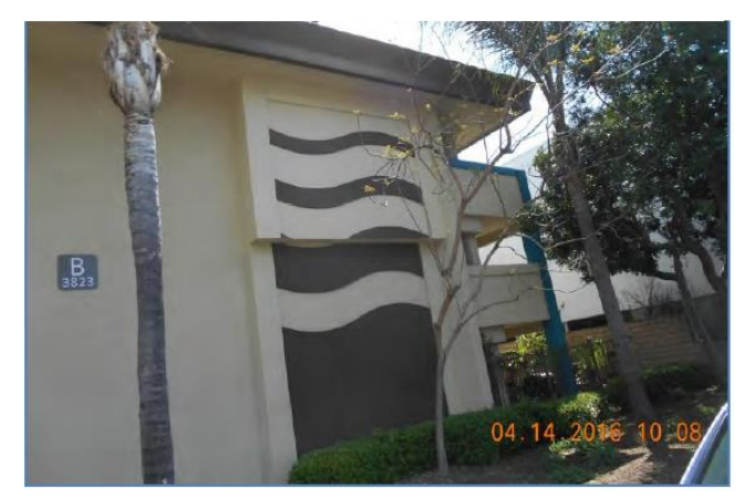
Figure 5: Although façade-mounted boxes are not preferred, this example from San Diego achieves integration with the structure.