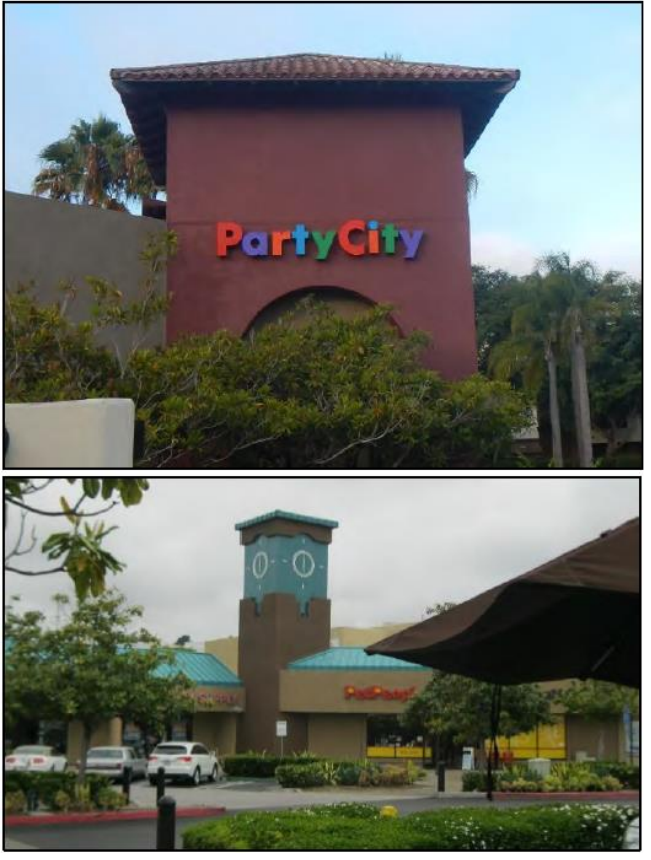
Figure 4: A cupola (above) and a clock tower (below) conceal antennas.