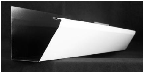
GUTTER ALUM. PAINTED GUTTER