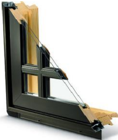
WINDOWS ALUMINUM CLAD WINDOWS