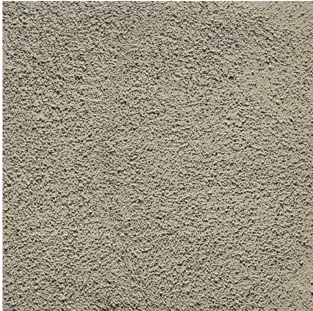
EXTERIOR CEMENT PLASTER MED. SAND FLOAT FINISH