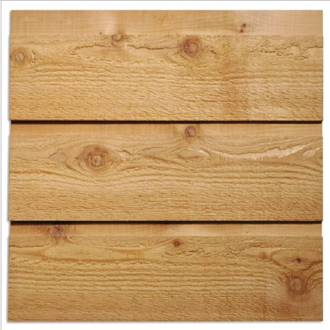
WOOD SIDING CHANNEL LAP SIDING