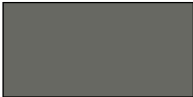
FASCIA BOARD KELLY MOORE KM-5826 VOLCANIC ROCK