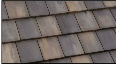
LIGHTWEIGHT CONCRETE ROOF TILE EAGLE ROOFING PRODUCTS 202 BL CONCORD BLEND