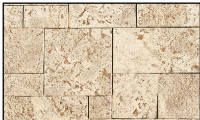
STONE VENEER BASE ELDORADO STONE COASTAL REEF