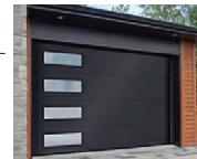
STEEL GARAGE DOOR