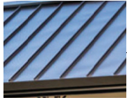
SHEET METAL ROOFING