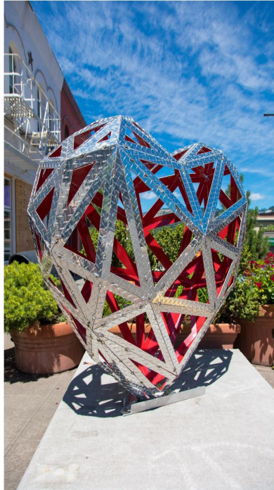
"Low-Poly Open Heart (RIDE)" 2017. Hydro-Cut Aluminum Diamond Plate, Tractor Paint. (AP) 5ft x 5ft x 2.5 ft.