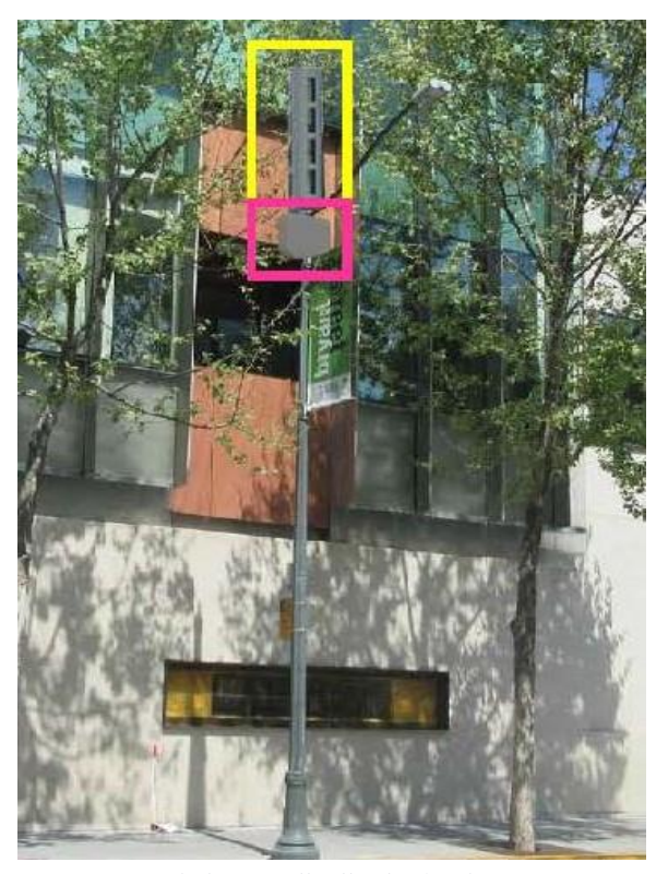
Figure 8: Stand-alone small cell poles (as shown in this example) are not preferred but may be permitted if enclosure of all equipment within the pole or in an underground vault is technically infeasible.