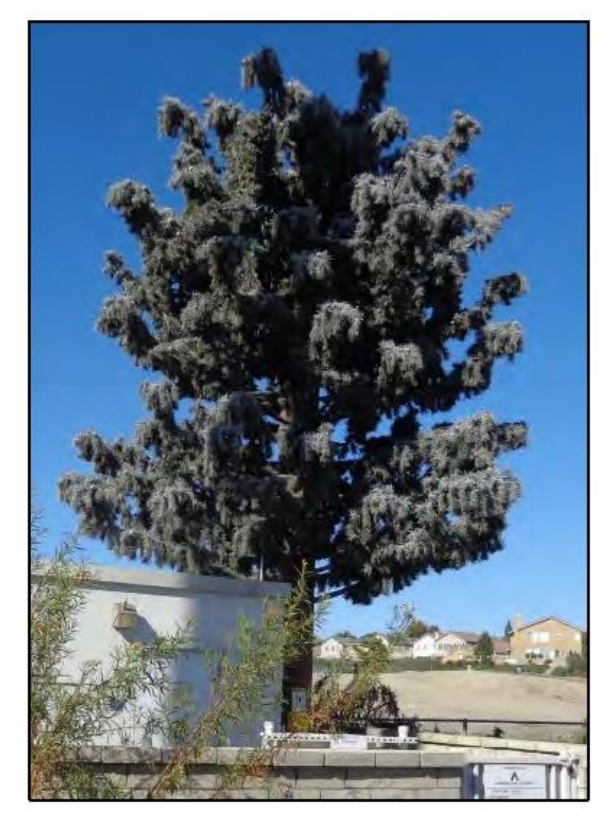
Figure 6: In this example, antennas are concealed by the faux "mono-pine."