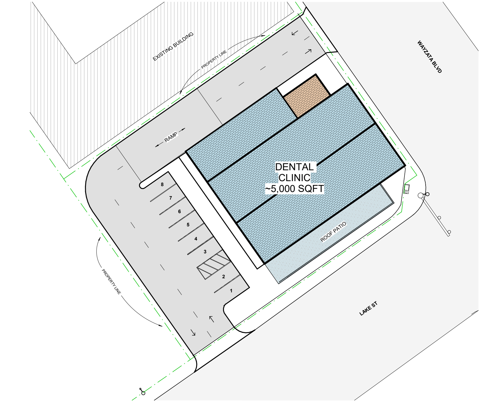
1 SITE PLAN A200 1/16" = 1'-0"