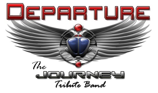
1255 Whisper Cove Drive Buford, GA 30518