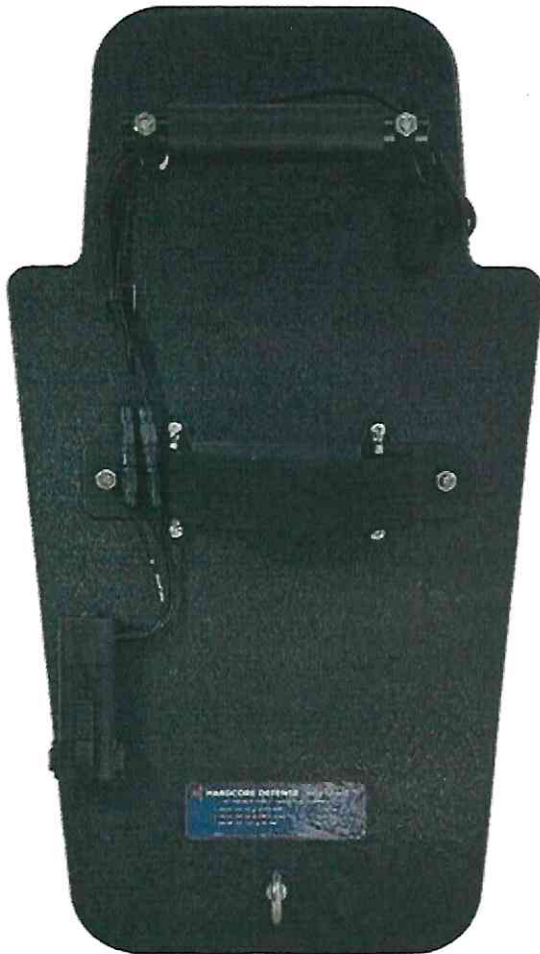
Shown with optional ballistic shield light, sold separately

18917 Saint Laurent Dr., Lutz, FL 33558 - ph 813-748-1473 www.PoliceBallisticShield.com