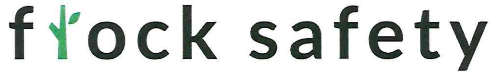
EXHIBIT A ORDER FORM