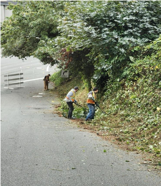
and some is by machine.