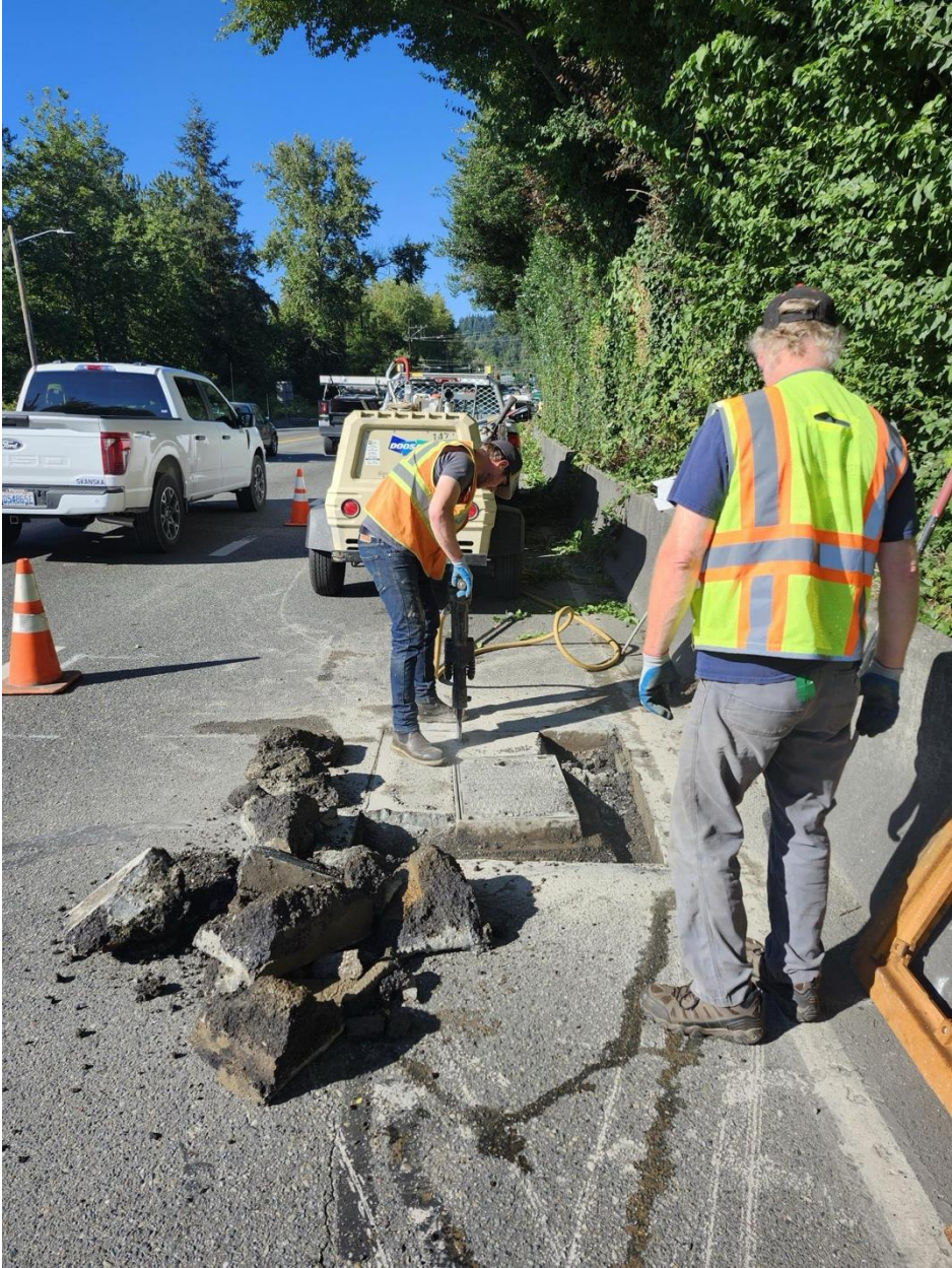
If you need a catch basin raised, we've got you covered. Our Public Works crews worked on this catch basin on Bothell Way adjusting it to ensure water flows off the street as it's supposed to.