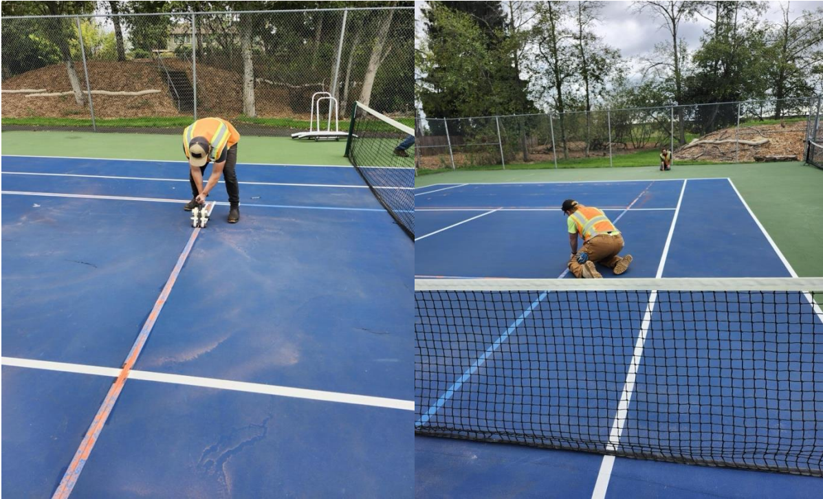
A work in progress in layout the new pickleball court lines.

Public Works crews laid out and added Pickleball Court lines to the tennis court at Horizon View Park.