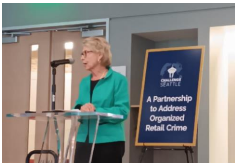
Gov. Christine Gregoire