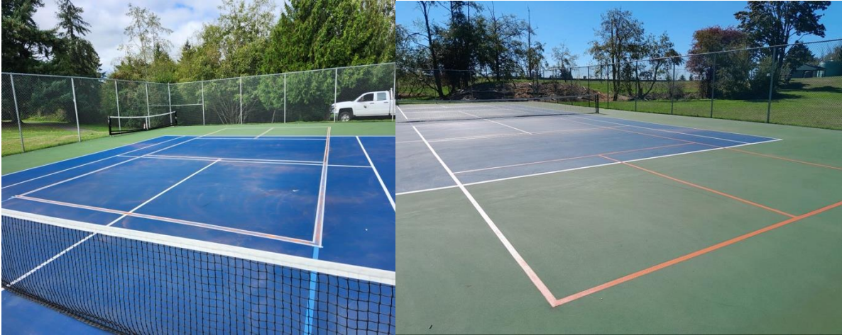
Lines are taped off and the final reveal is a fresh court ready for pickleballers of all ages.