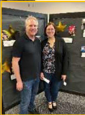
PTSA Golden Acorn Award 2024

ShoreLake Arts has seen staff changes, but stability going forward. As of July 1, 2024, the SLA Exec. Dir. Is: