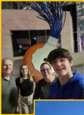
Eraser in Vegas!