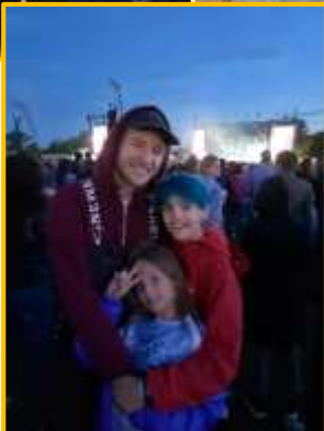
The Cure, Malahide Castle, Dublin 2019