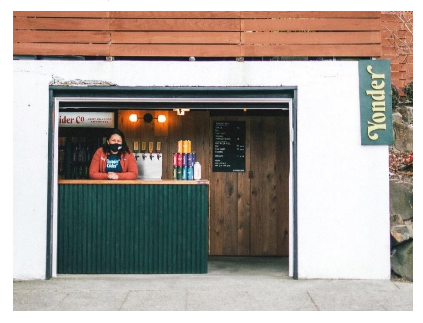
The "Yonder Bar", Seattle

The "Yonder Bar" opened in a garage in the Phinney Ridge neighborhood of Seattle in August 2020. In 2021, the cider company moved to a larger tasting room in the Ballard neighborhood. <a href="https://www.yondercider.com/yonderbar">https://www.yondercider.com/yonderbar</a>