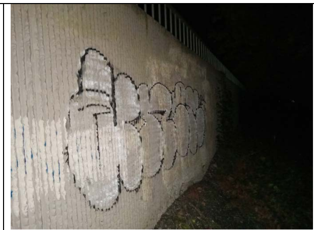
Graffiti example 2

Officers responded to a collision in the 17000 blk of Bothell Way NE. While conducting their collision investigation, they noticed obvious signs of impairment by the causing driver. The driver was investigated for DUI and subsequently arrested.