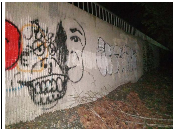
Graffiti example 1

A sergeant on patrol observed newer graffiti on the retaining wall in the 15300 blk of Bothell Way NE. This sergeant has monitored graffiti in LFP for several years and is unfamiliar with these new graffiti "tags". It's unknown if this is a new vandal or someone who has changed their moniker.