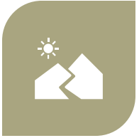
ROUNDBOUT – FALL 2025