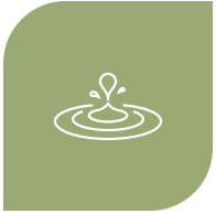
L90 – SPRING 2026