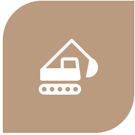
SEWER LIFT STATION – DESIGN 2025, CONSTRUCTION SPRING 2026