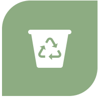
MATERIAL BINS – SPRING 2025