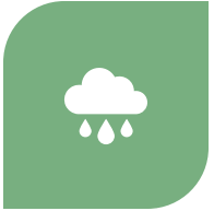
STORMWATER MASTER PLAN – 2026