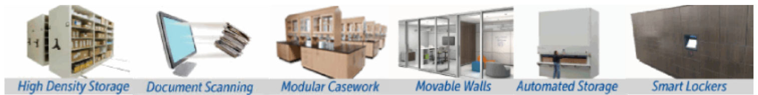
High Density Storage