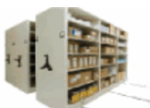
High Density Storage