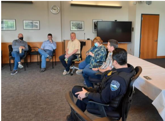
Coffee with the Mayor