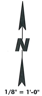
PRELIMINARY FLOOR PLAN SCALE: 1/8"=1'-0"