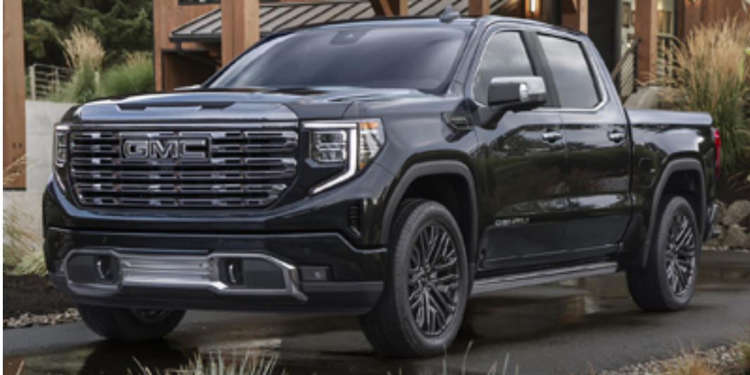
Note:Photo may not represent exact vehicle or selected equipment.

Vehicle: [Fleet] 2024 GMC Sierra 1500 (TK10543) 4WD Crew Cab 147" Pro (✔ Complete)