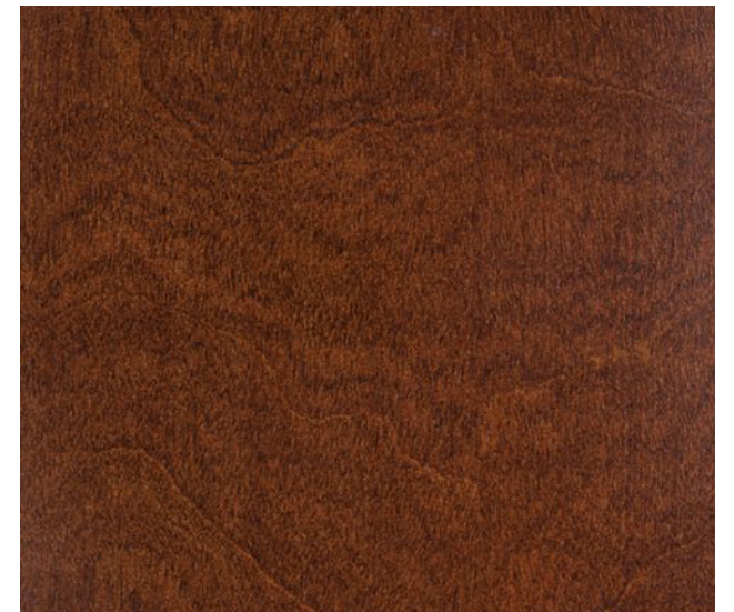
DOOR STAIN - MASONITE ARCHITECTURAL - ESPRESSO STAIN - ALL PREFINISHED WOOD DOORS