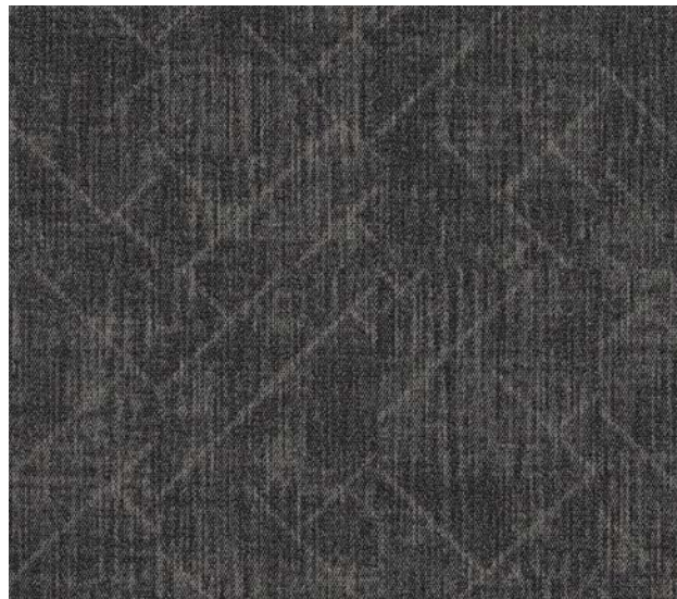
CARPET TILE - SHAW CONTRACT - CENTERED TILE - SPONTANEOUS 5T492-90505- 18" X 36" - MONOLITHIC INSTALLATION