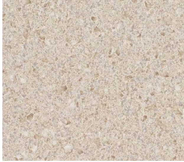
HIGH PRESSURE LAMINATE - WILSONART - KALAHARI TOPAZ 4588 - CASEWORK COUNTERTOP LAMINATE