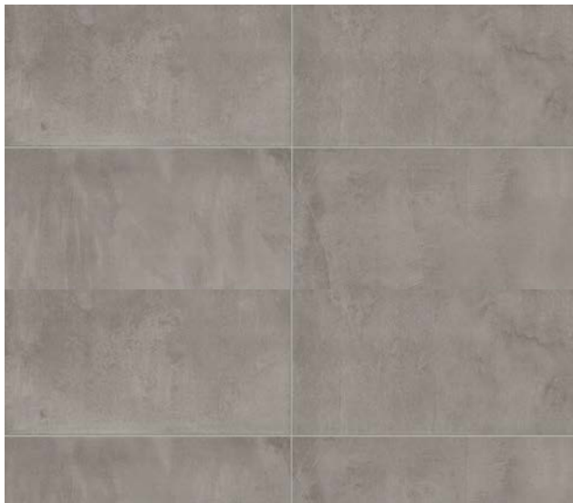
PORCELAIN FLOOR TILE - DAL TILE - CHORD - FORTE GREY 12" X 24" - MONOLITHIC INSTALLATION - RESTROOMS ONLY