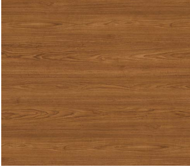
HIGH PRESSURE LAMINATE - WILSONART - NEPAL TEAK 7209- CASEWORK LAMINATE