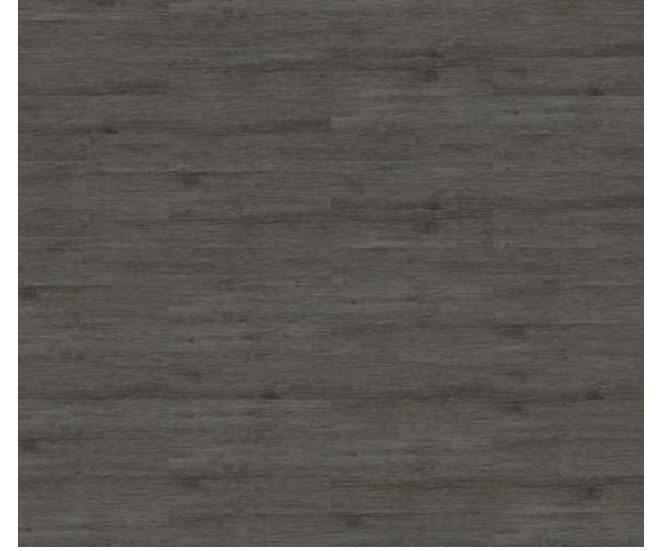
LUXURY VINYL TILE - SHAW CONTRACT - UNCOMMON GROUND 4" - SKYLINE 0187V-02560 - ASHLAR INSTALLATION - HALLWAYS