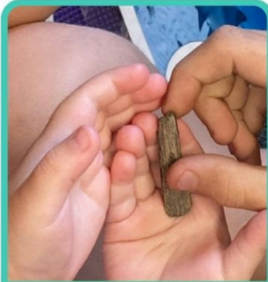
Bronson Library, June 9

"Make everything as simple as possible but not simpler." Albert Einstein