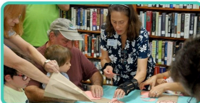
Luther Callaway Library, Chiefland, June 12