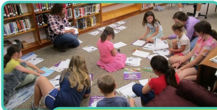
A.F. Knotts Library, Yankeetown, June 10