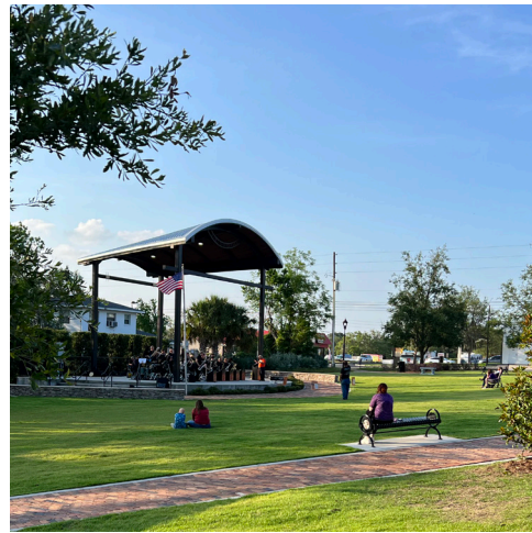
Event Lawn Area