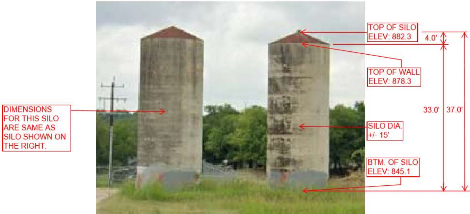
7520 HUEBNER ROAD SILOS