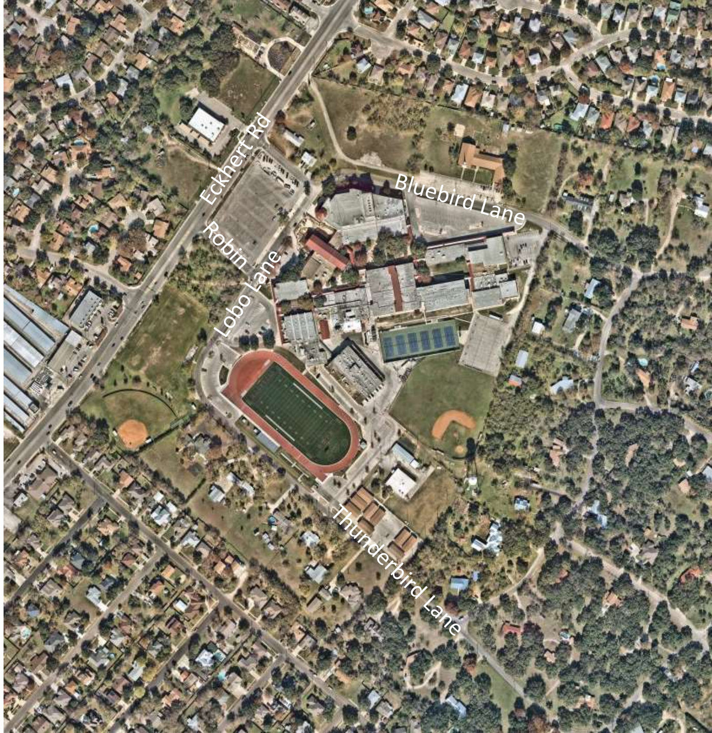
John Marshall High School Monte Robles Park