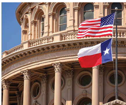
Texas Municipal League Legislative Advocacy Toolkit