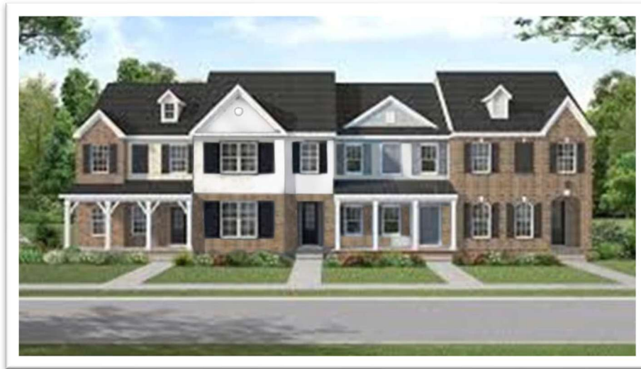
Ex. No. 1 - Rear Entry Townhouse Dwelling Units