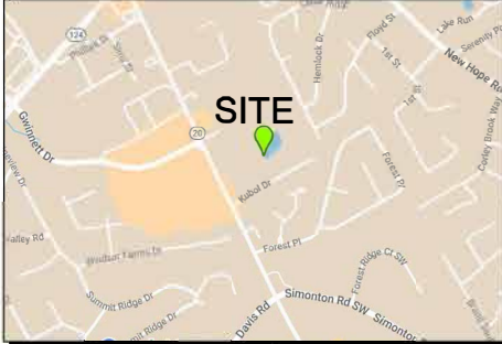
SITE LOCATION MAP (NOT TO SCALE)