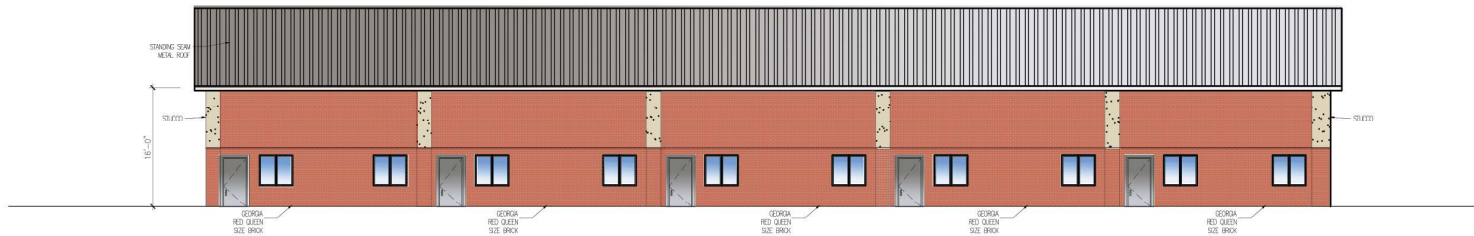
1 PRELIMINARY FRONT ELEVATIONS SCALE: 1/8" = 1'-0"