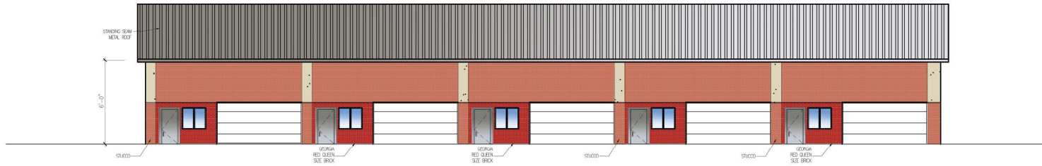
2 PRELIMINARY REAR ELEVATIONS SCALE: 1/8" = 1'-0"