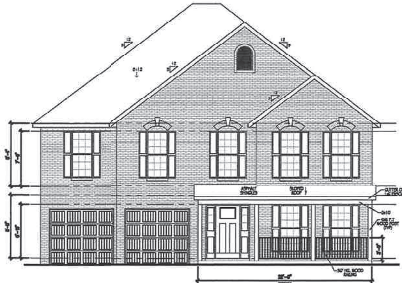
C 1 FRONT ELEVATION SCALE: 1/8" = 1'-0"