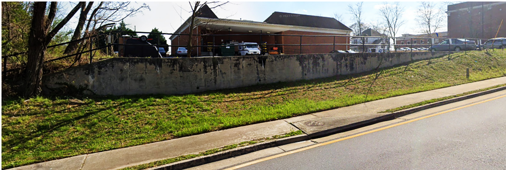
Pike Street law wall.

Here we have 2 walls intersections close to the Lawrenceville Bloom, to continue in the same spirit I am proposing the above ideas