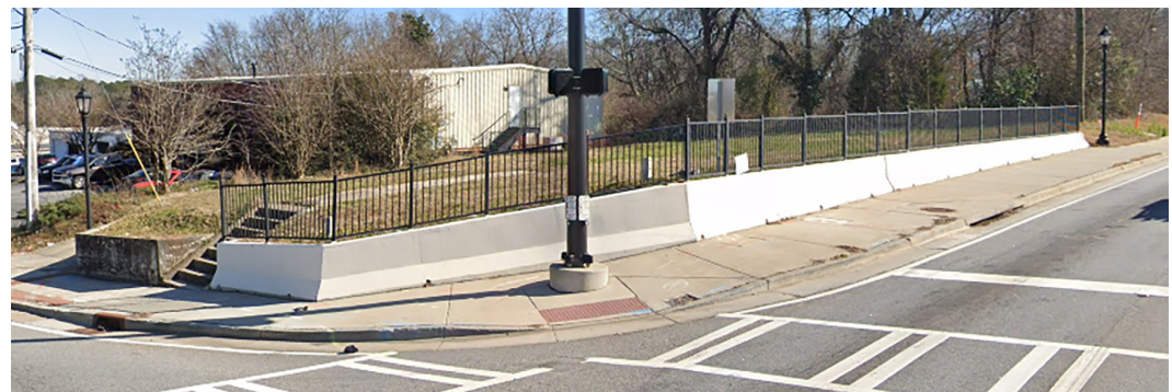
Intersection -Jackson &Crogan st-