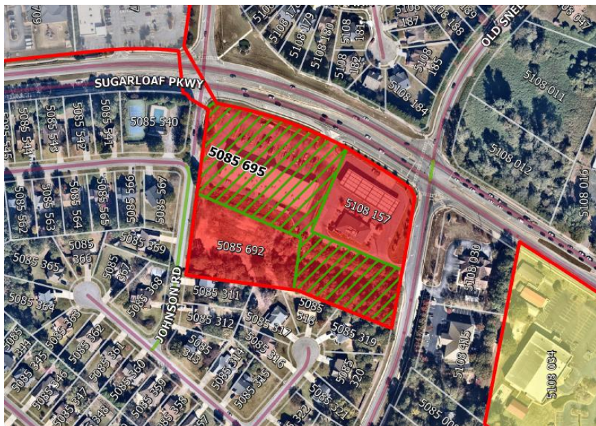
The City of Lawrenceville Planning & Development Location Map & Surrounding Areas