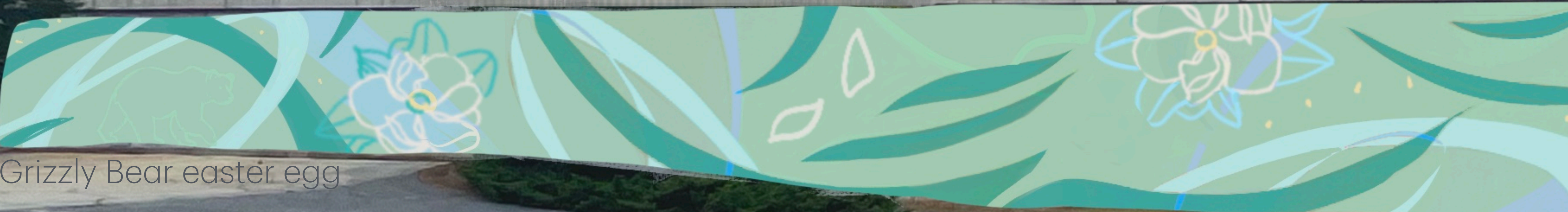
Grizzly Bear easter egg