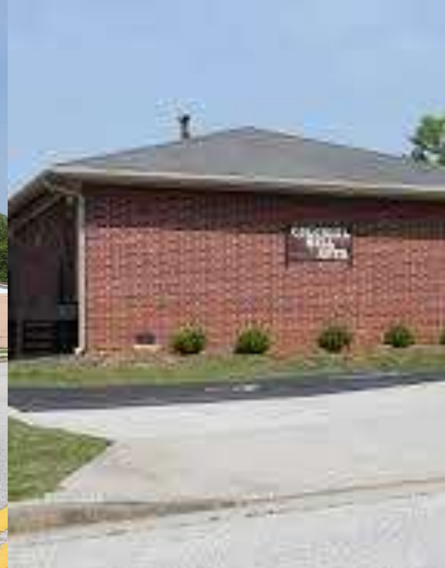
F.I.R.S.T. Housing Center (For Intensive Response and Support Transitions)