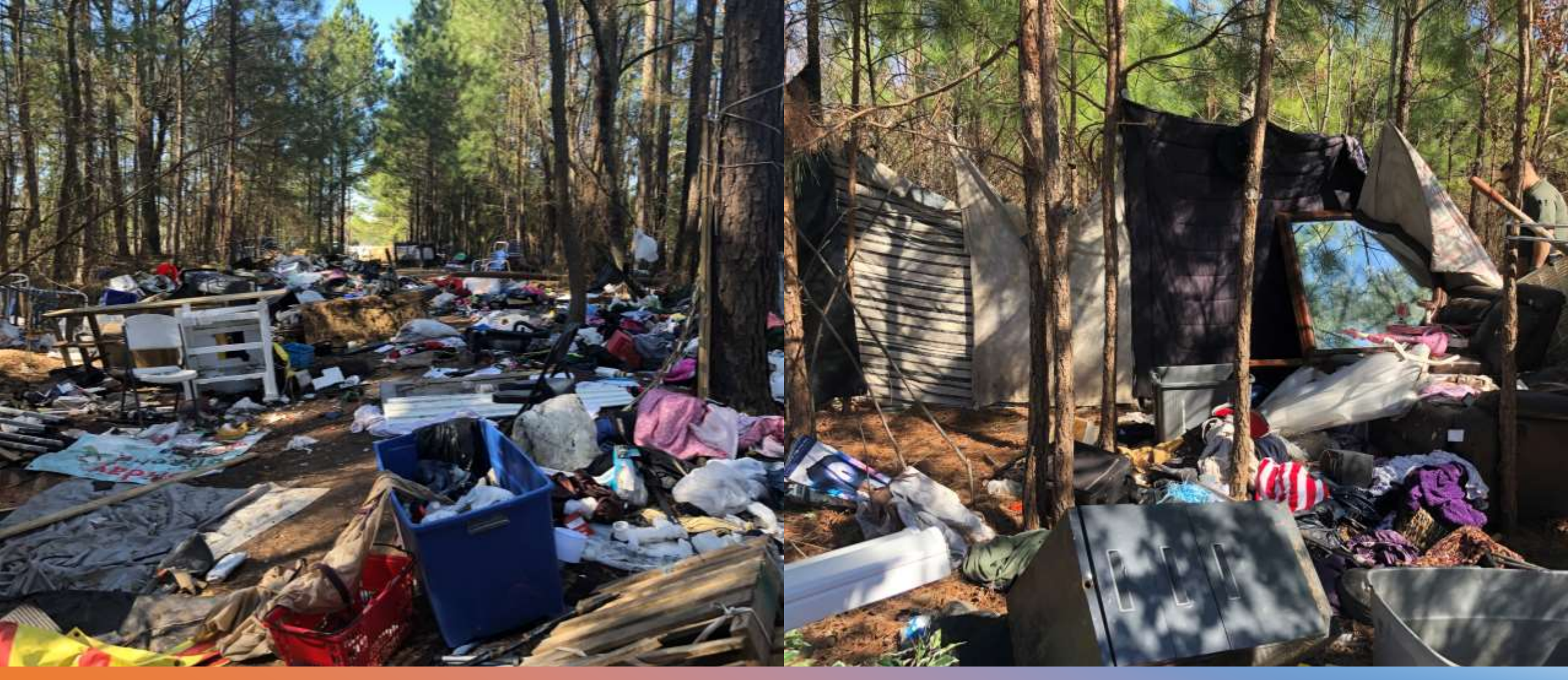
Homeless encampments in Lawrenceville (January 2023)