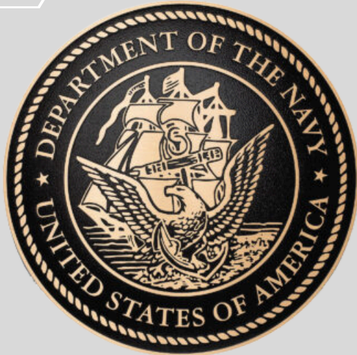
Live Sample Shown in Bronze