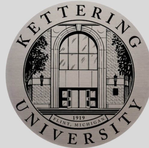
Live Sample Shown in Chemical Etched Stainless